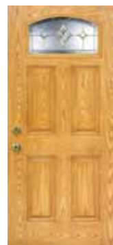
429STJ◇ ○ pg. 10