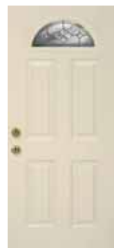
400STJ◇ ○◆◆ pg. 7