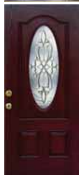
150STJ ● pg. 36