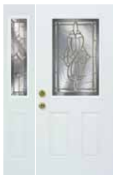
130STJ ●◆◆ pg. 40