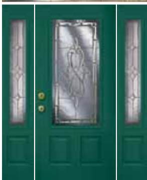
140STJ ●◆◆ pg. 43