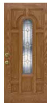
243STJ ○ pg. 24