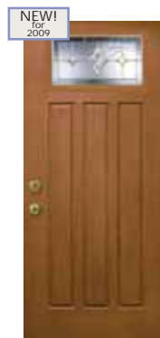
420STJ◇ ○ pg. 9