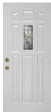
110STJ† □◆◆ pg. 11