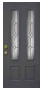
240STJ ◆◆ pg. 28