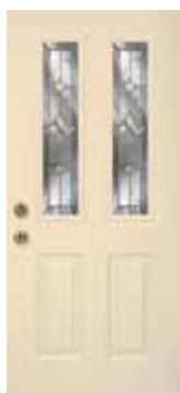
230STJ ○◆◆ pg. 16