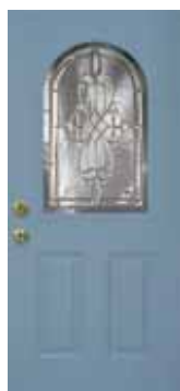
439STJ◇† ○◆◆ pg. 20