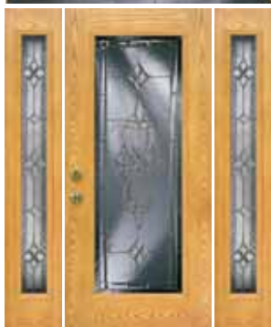
160STJ ●◆◆ pg. 44