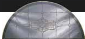
532STJ† pg. 63