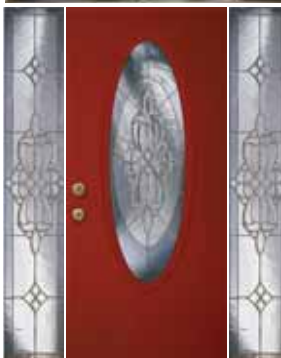
770STJ† ●◆◆ pg. 51