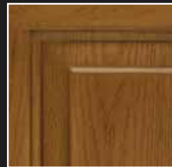
Legacy 20-gauge Woodgrain Textured Steel