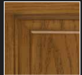
Legacy 22-gauge Woodgrain Textured Steel

To select stain color, refer to our color selector for accurate color representation.